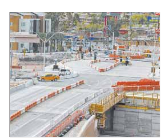
Diverging diamond interchange lanes are rebuilt on Tropicana Avenue following alterations to accommodate Super Bowl 58.