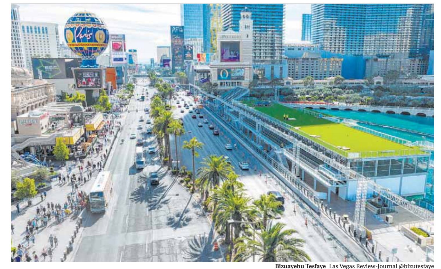
Workers add the finishing touches Tuesday to the Formula One Grand Prix grandstands at the lake in front of Bellagio.

Off-Strip resorts have own strategies in luring guests during F1 Grand Prix. 12E